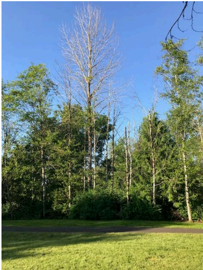
Pictures taken by Erik Molander of dead/diseased/dying trees in the Roth Estates "green space" that need to be cut down or trimmed. (May 2018)